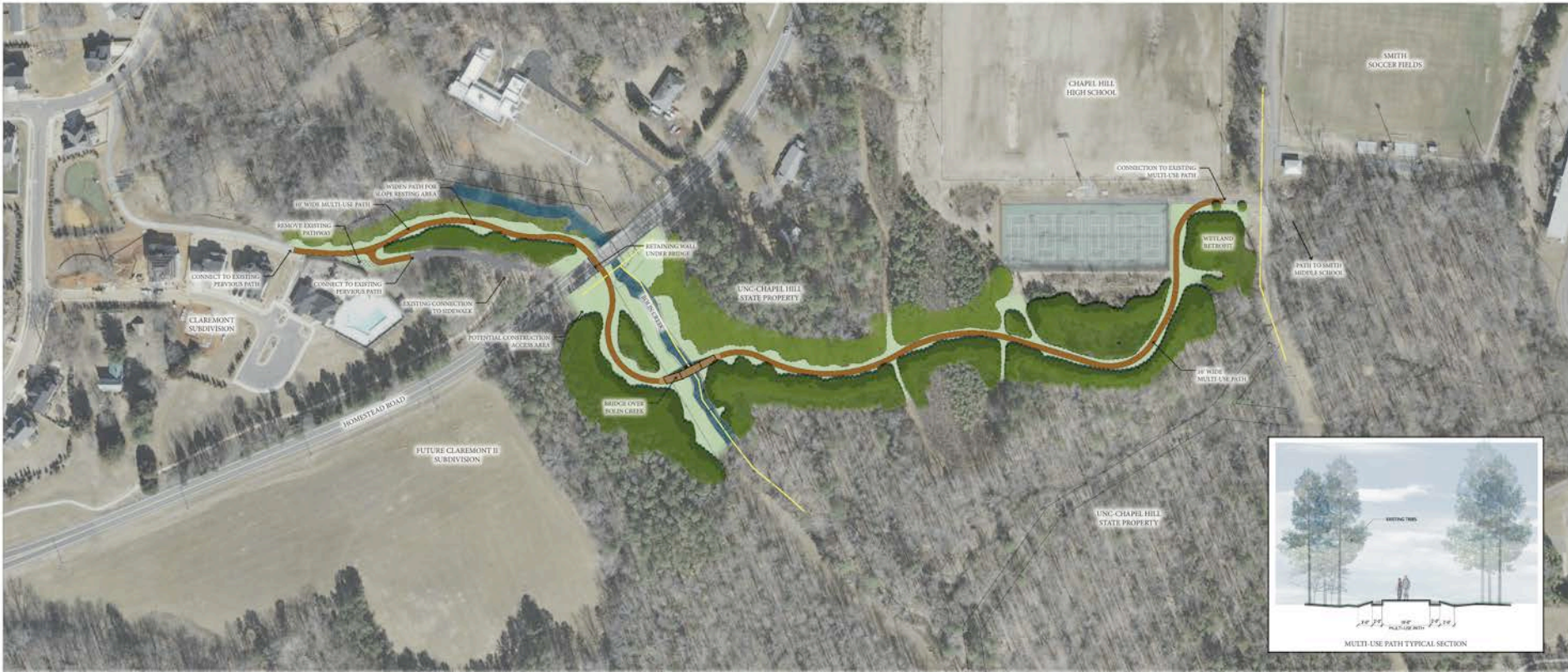
HOMESTEAD-CHAPEL HILL HIGH SCHOOL MULTI-USE PATH FROM THE CLAREMONT SUBDIVISION NORTH OF HOMESTEAD ROAD TO CHAPEL HILL HIGH SCHOOL PUBLIC MEETING MAP